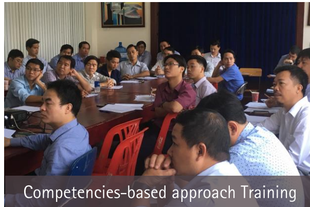
Competencies-based approach Training